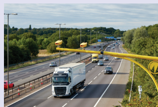
Traffic Management & Smart Cities