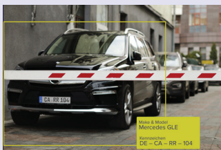
Access Control, Fleet Management & Parking