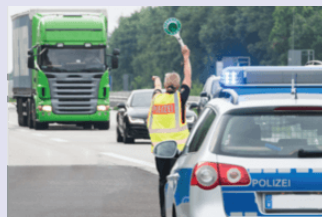
Safety, Security & Law Enforcement